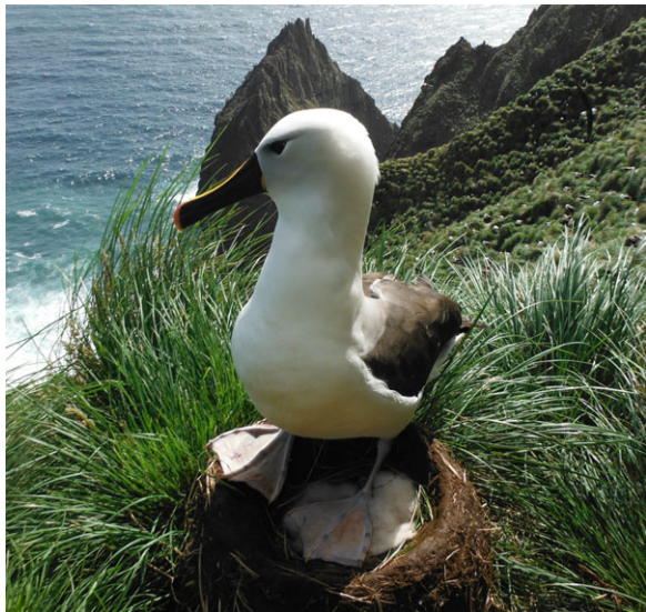
FIGURE 1 Adult Indian yellow-nosed albatross over dead chick at the Entrecasteaux cliffs on Amsterdam Island (37.8°S, 77.6°E) where recurrent massive chick mortality events have been occurring.

conveyors” of diseases (Harvell et al., 1999, 2002). Understanding and managing infectious diseases in marine ecosystems is thus a current priority (Lafferty & Hofmann, 2016), especially at higher latitudes which include some of the places most dramatically impacted by climate change (Van Hemert, Pearce, & Handel, 2014).